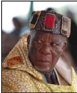
Jira Buipewura Abdulai Jinapor II Paramount Chief of the Buipe Traditional Council